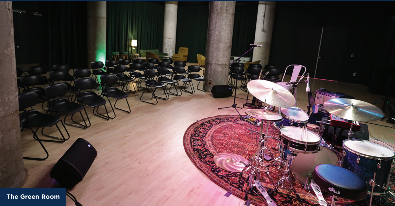
The Green Room

Each of these contemporary art galleries offers a clean canvas that allows for more personalized or streamlined events.